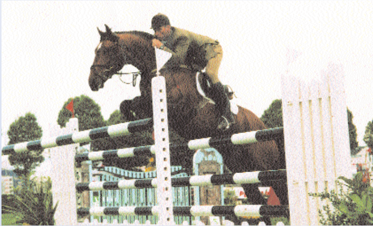
Classic Vision, RID Stallion, Grade A showjumper. Sire: Ginger Dick. Dam: Lady Glen

Registered Irish Draught stallions are inspected for type, conformation, movement, soundness and temperament. Colts for inspection must be at least three years of age and must pass a veterinary examination and performance test as part of the approval procedure.