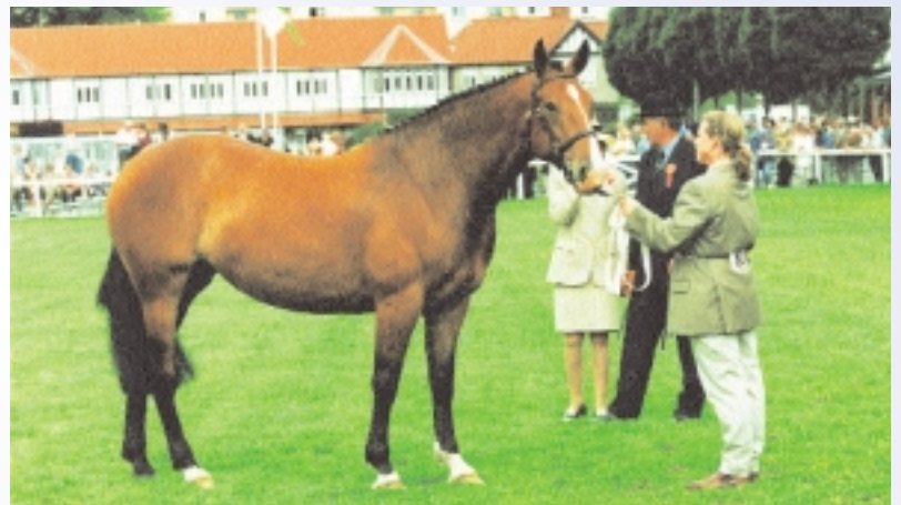
Derrynagarra Clorin RID. Reserve Champion National Show 2000 and RDS 2000 Sire: Crosstown Dancer Dam: Banks Fee Annabel