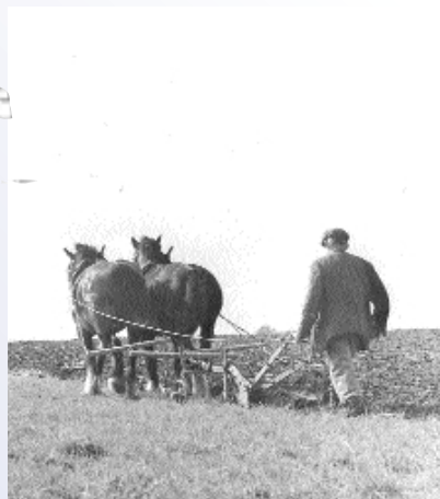
Farmers worked their horses alone or coupled with a neighbour's horse for heavier work

Consequently today's Irish Draught is not simply a working horse, it is a riding and sporting horse as well.