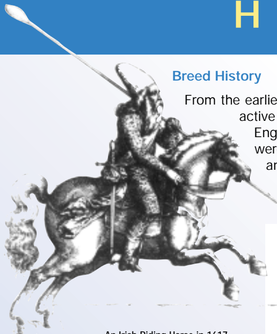
An Irish Riding Horse in 1617

From the earliest times horses have always been part of Irish life. Over the years the small active native horse was crossed with Norman warhorses, Great Horses from England and also Spanish Andalusian stallions brought in by way of trade. There were many schemes throughout the 19th and 20th centuries to increase the size and quality of the Irish Draught Horse in which the thoroughbred horse played a significant role. From these beginnings the Irish Draught Horse of today evolved.