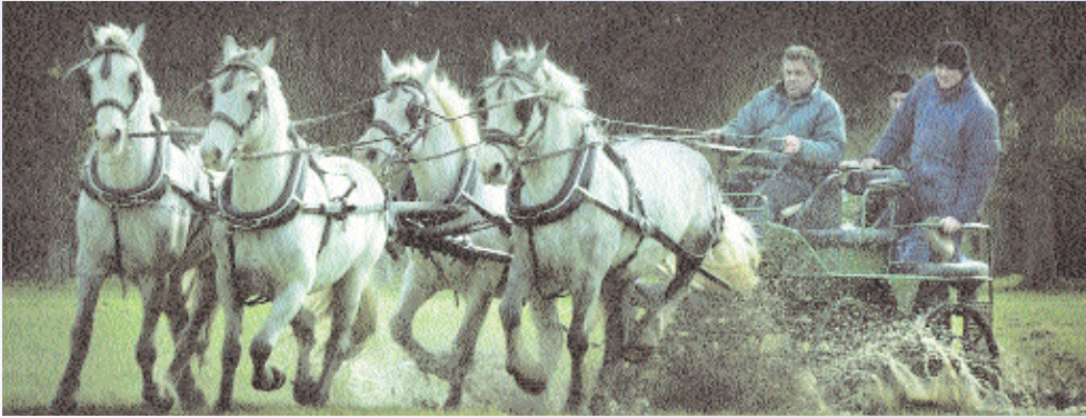
A team of four Irish Draught geldings coping easily with a water hazard

One of the real strengths of the Irish Draught Horse is its Versatility. Because of its wonderful temperament it learns quickly and is very easy to work with. Its strength, intelligence and lightness of step means that it can perform in many varied disciplines including show jumping, eventing, dressage, driving, le trek and endurance riding. Above all its reliability makes it an extremely safe and sound horse for the amateur and leisure rider. Today the Irish Draught Horse is to be found competing in every aspect of equestrian sport. It is also being used as a Police Horse in many countries.