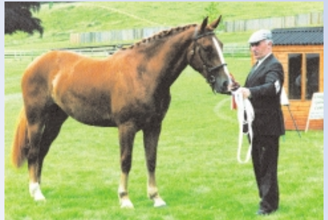
Killountain Pearl RID. Youngstock winner at the National Show Sire: Crannagh Hero Dam: Killountain Diamond

The national breed show is run by the Society annually. It is hosted by Branches of the Society and the show location changes every two years. There are classes for mares, foals, stallions, young stock and also a performance section. Every year 300–500 of the best of the breed attract visitors from all over the world. It is the place to see the world's greatest gathering of Irish Draught Horses.