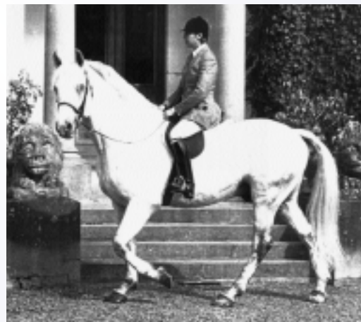
Pride of Shaunlara, by Milestone RID, out of Boston Burglar by Prefairy. This stallion had a pre-eminent influence on today's Irish Draught