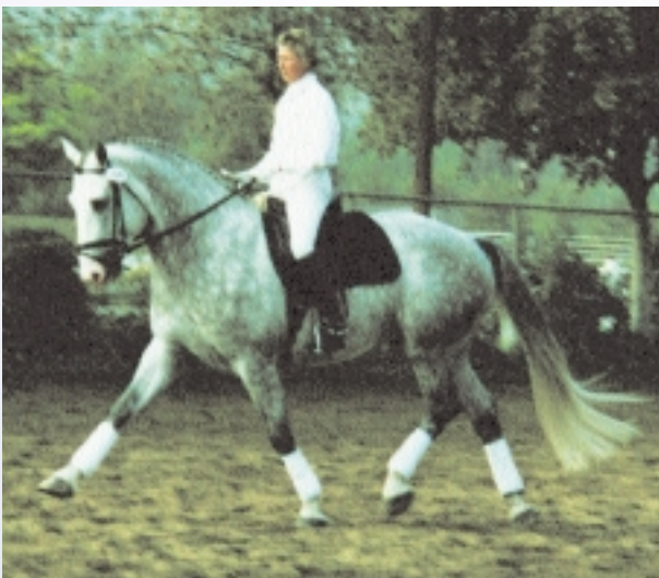
← O'Leary's Irish Diamond, RID Stallion winner of numerous dressage championships in the United States. Sire: Glidawn Diamond Dam: Grey Currangong