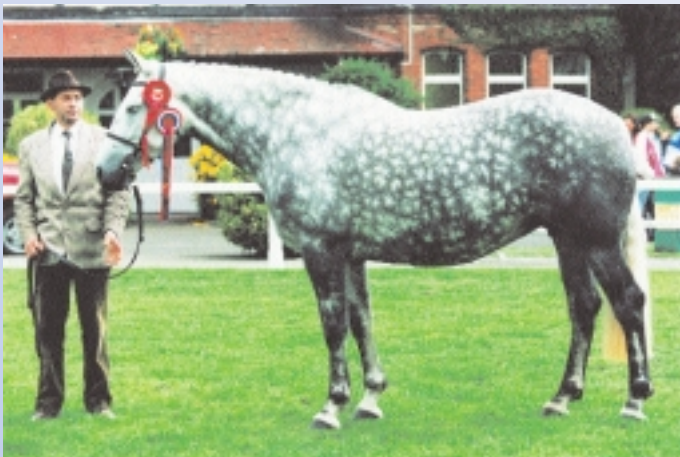
The Blue Lady, RID, winner of the Royal Dublin Society Irish Draught Mare Championship in 1996 and 1999 and winner of the Breeders Championship in 1996. Sire: Blue Rajah. Dam: Seafin Lady

All potential Registered Irish Draught mares are inspected for type, conformation and movement. Mares for inspection must be at least two years of age and must pass a veterinary examination. Inspections are held at locations round the country during the autumn of each year.