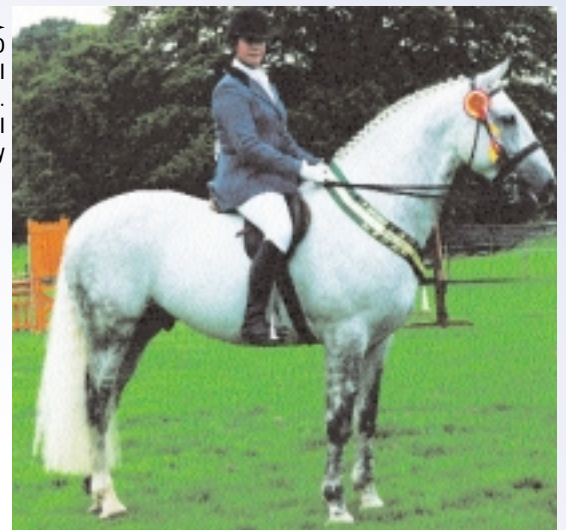
→ Huntingfield Rebel, RID stallion, National Performance Champion. Sire: Glenagyle Rebel Dam: Whippy