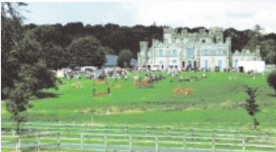
Necarne Castle, Co Fermanagh, location of the National Show 2000 – 2001.