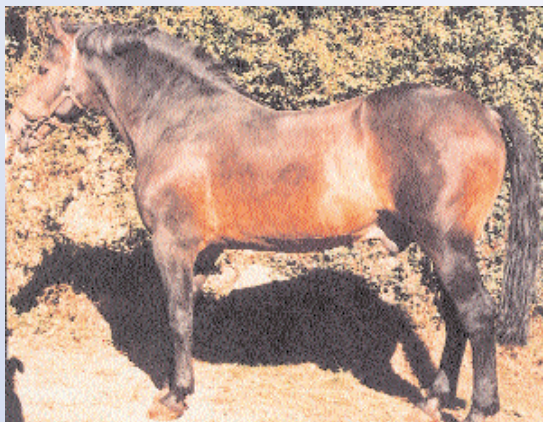
Clover Hill, RID stallion, by Golden Beaker. One of Ireland's greatest sires of showjumpers