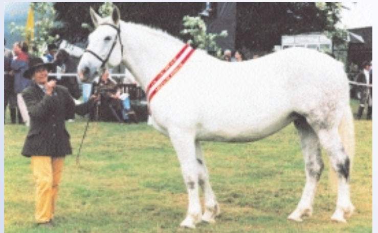
Brehan's Pride, RID. Winner of All Ireland Championship in 1996 Sire: Pride of Toames. Dam: Brehan Lass