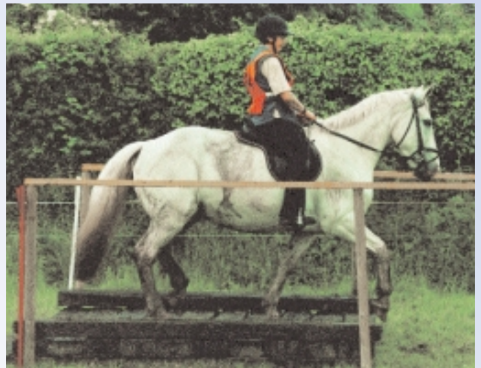
Chrystal Breeze RID mare, prizewinning Le Trec competitor, by Heather Breeze out of April Jewel