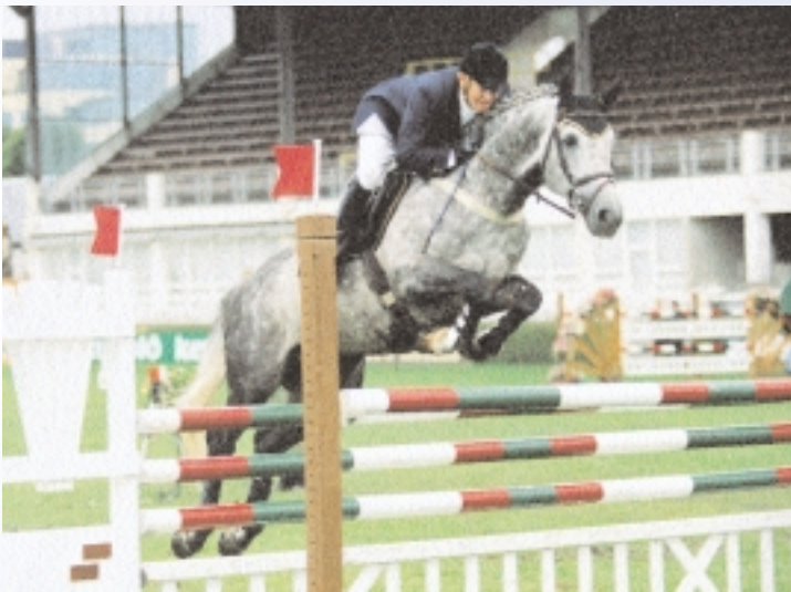
Sir Rivie, RID Stallion, successful show jumper. Sire Sea Crest. Dam: Ginger Anne