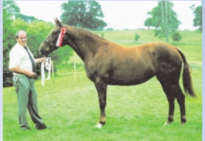
Lady in Red RID, winner of Mare of the Future and many other Championships. Sire: Grosvenor Lad Dam: Ginger Grace