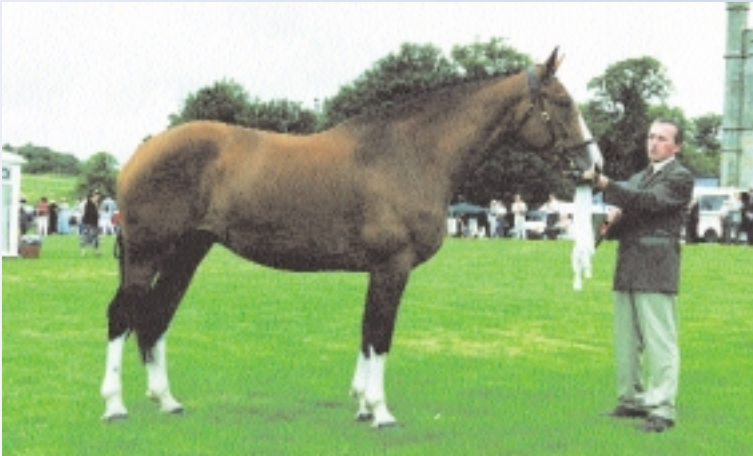
Enniskeane Flash RID. Winner of Bank of Ireland All Ireland RID Championship and numerous other Championships. Sire: Mountain Pearl Dam: Enniskeane Primrose

In co-operation with the Irish Shows Association the Irish Draught Horse Society holds All Ireland Irish Draught Mare and Young Horse Championships for which contenders must qualify at venues round the country for finals at the National Show.