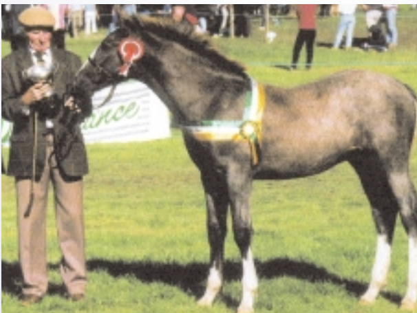
Irish Draught foal, winner of the FBD Connaught Championship. Sire: Huntingfield Rebel Dam: Oh Carol