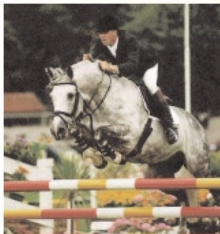
Cruising (ISH) 1985 approved stallion by Sea Crest (RID), out of Mullacrew (ISH), by Nordlys (TB) bred at Hartwell Stud, Kill, Co Kildare. Winner of Grand Prix in Aachen and Dortmund in 1999