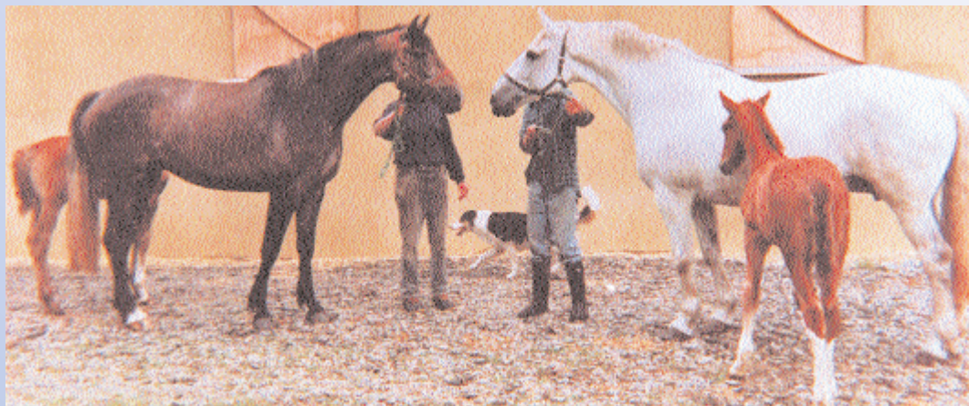
Kildalton Countess RID, dam of five RID stallions. Sire: Ben Purple Dam Enniskeane Countess with her grand daughter Enniskeane Primrose RID, Sire: Ginger Dick Dam: Creggan Rose.