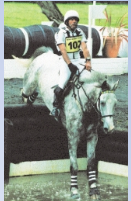
Kingman, ID gelding, consistently successful three-day-event competitor. Sire: Creggan Diamond Dam: Serene Sunset