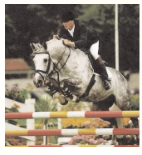
Cruising (ISH) 1985 approved stallion by Sea Crest (RID), out of Mullacrew (ISH), by Nordlys (TB) bred at Hartwell Stud, Kill, Co Kildare. Winner of Grand Prix in Aachen and Dortmund in 1999