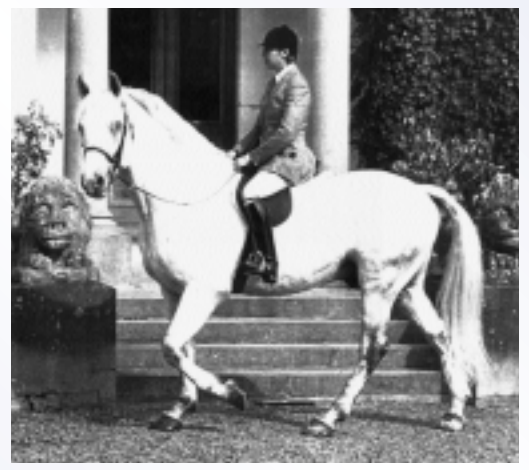
Pride of Shaunlara, by Milestone RID, out of Boston Burglar by Prefairy. This stallion had a pre-eminent influence on today's Irish Draught