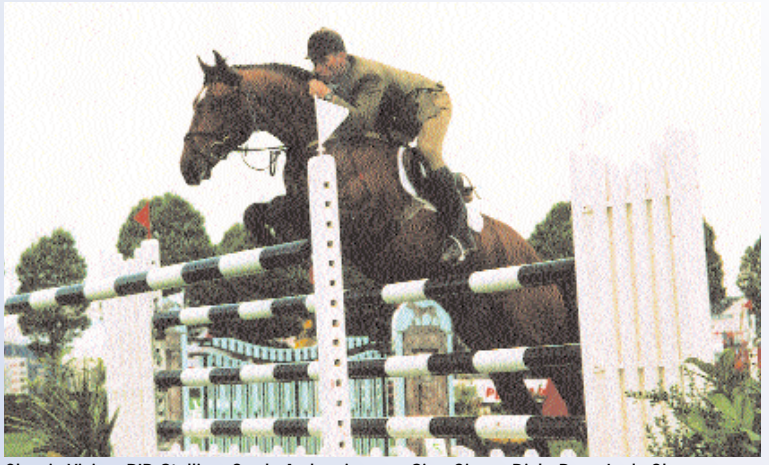
Classic Vision, RID Stallion, Grade A showjumper. Sire: Ginger Dick. Dam: Lady Glen

Registered Irish Draught stallions are inspected for type, conformation, movement, soundness and temperament. Colts for inspection must be at least three years of age and must pass a veterinary examination and performance test as part of the approval procedure.