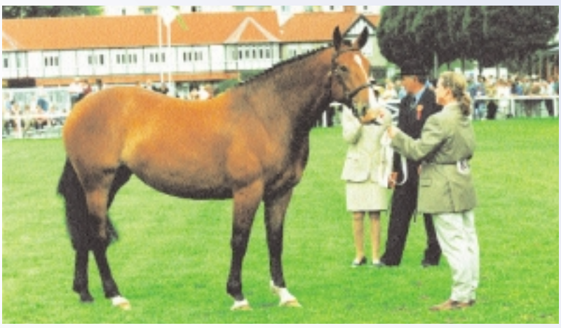
Derrynagarra Clorin RID. Reserve Champion National Show 2000 and RDS 2000 Sire: Crosstown Dancer Dam: Banks Fee Annabel