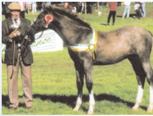
Irish Draught foal, winner of the FBD Connaught Championship. Sire: Huntingfield Rebel Dam: Oh Carol