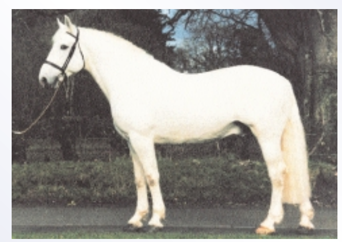
Annaghdown Star, RID Stallion, winner of the stallion class at the Royal Dublin Society Horse Show in 1991, 1993, and 1997. Sire: King Elvis Dam: Annaghdown Gold