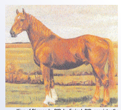
King of Diamonds, RID, by Errigal, RID, consistently ranked among sires of showjumpers in world rankings since 1990