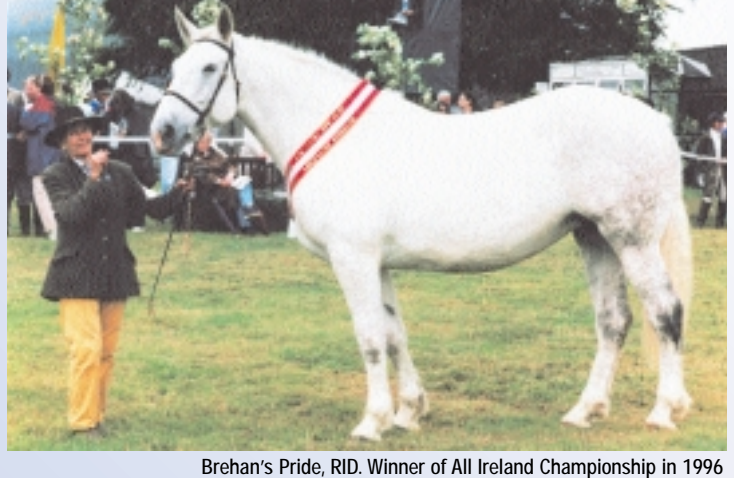
Sire: Pride of Toames. Dam: Brehan Lass