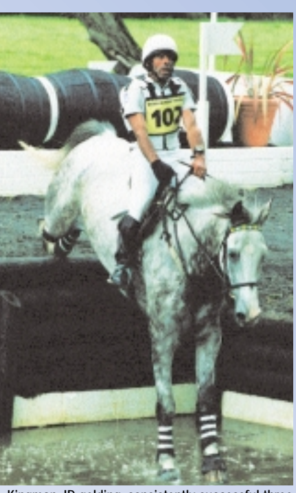
Kingman, ID gelding, consistently successful threeday-event competitor. Sire: Creggan Diamond Dam: Serene Sunset