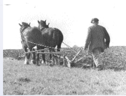
Farmers worked their horses alone or coupled with a neighbour's horse for heavier work