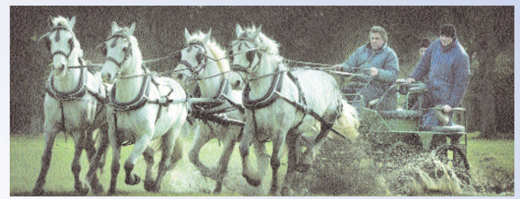
A team of four Irish Draught geldings coping easily with a water hazard

One of the real strengths of the Irish Draught Horse is its Versatility. Because of its wonderful temperament it learns quickly and is very easy to work with. Its strength, intelligence and lightness of step means that it can perform in many varied disciplines including show jumping, eventing, dressage, driving, le trek and endurance riding. Above all its reliability makes it an extremely safe and sound horse for the amateur and leisure rider. Today the Irish Draught Horse is to be found competing in every aspect of equestrian sport. It is also being used as a Police Horse in many countries.