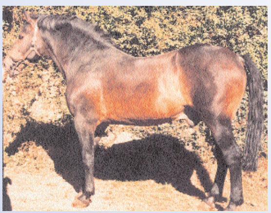
Clover Hill, RID stallion, by Golden Beaker. One of Ireland's greatest sires of showjumpers