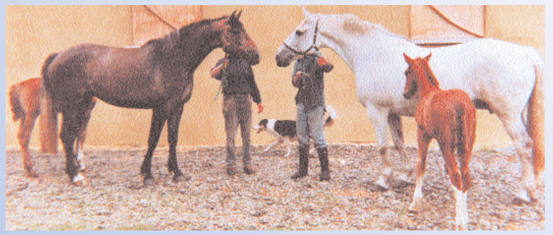
Kildalton Countess RID, dam of five RID stallions. Sire: Ben Purple Dam Enniskeane Countess with her grand daughter Enniskeane Primrose RID, Sire: Ginger Dick Dam: Creggan Rose.