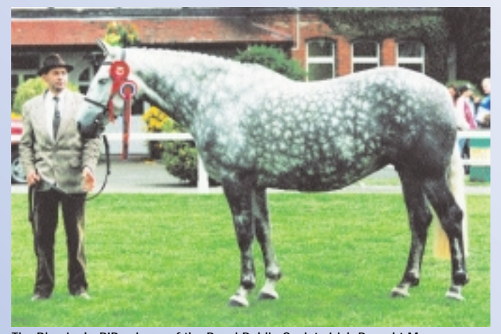
The Blue Lady, RID, winner of the Royal Dublin Society Irish Draught Mare Championship in 1996 and 1999 and winner of the Breeders Championship in 1996. Sire: Blue Rajah. Dam: Seafin Lady

All potential Registered Irish Draught mares are inspected for type, conformation and movement. Mares for inspection must be at least two years of age and must pass a veterinary examination. Inspections are held at locations round the country during the autumn of each year.