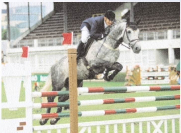
Sir Rivie, RID Stallion, successful show jumper. Sire Sea Crest. Dam: Ginger Anne