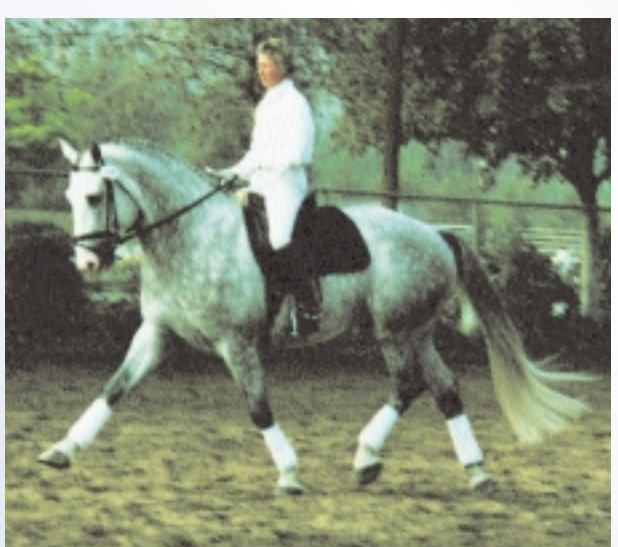
O'Leary's Irish Diamond, RID Stallion winner of numerous dressage championships in the United States. Sire: Glidawn Diamond Dam: Grey Currangong