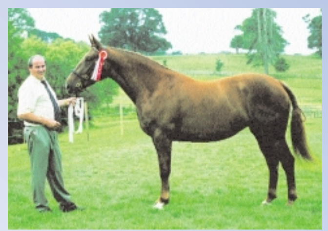
Lady in Red RID, winner of Mare of the Future and many other Championships. Sire: Grosvenor Lad Dam: Ginger Grace