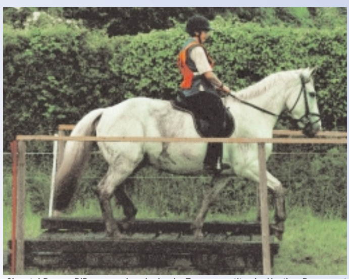
Chrystal Breeze RID mare, prizewinning Le Trec competitor, by Heather Breeze out of April Jewel